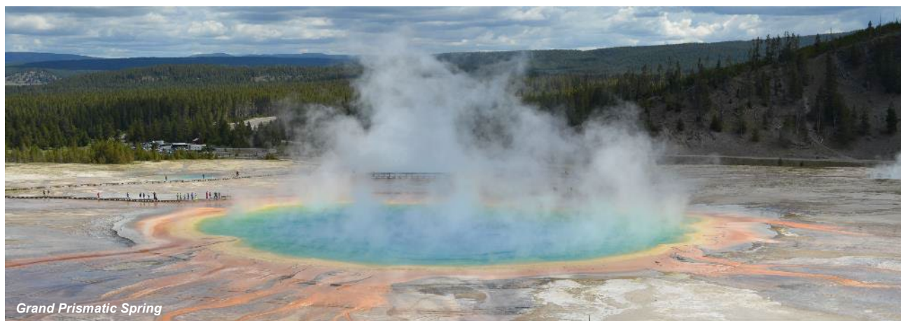
Grand Prismatic Spring

Our final 14 mile stretch between Madison Junction and West Yellowstone can be very productive for wildlife. Rocky Mountain Elk are common and both Moose and Black Bear are likely. Birds to look out for include Red-tailed Hawk, Sharp-shinned Hawk, Black-headed Grosbeak, Red-naped Sapsucker, Clark's Nutcracker and Gray Jay. Here we are also sure to encounter the majestic North American Bison, an animal that was driven to the brink of extinction from an initial population estimated to number over 65 million! The story of the Bison is one of the most tragic in natural history, but today nearly 5,000 animals roam the grasslands of Yellowstone National Park and the sight of a herd feeding or slowly plodding across the road in front of us will no doubt be one of the enduring memories of the holiday. A comfortable hotel in West Yellowstone will be base for the following 4 nights whilst we explore the western and central highlights of the national park.